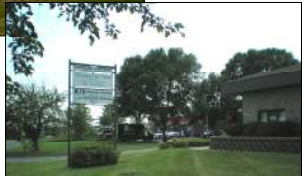
Above: Exterior View of building for sale Right: Exterior Signage (south view)