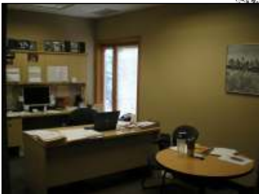
Interior View Private Office