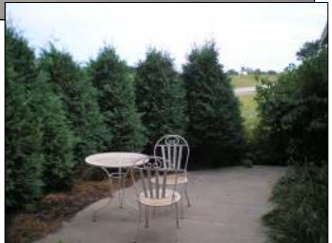
Tranquil outdoor patio