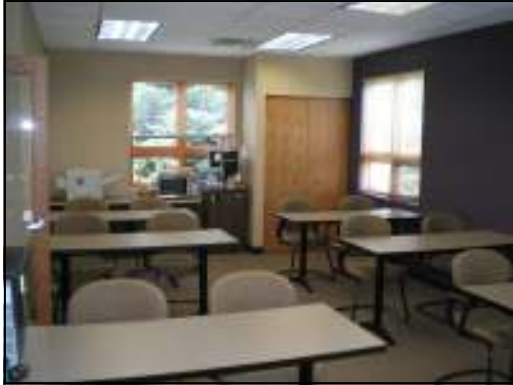
Large Conference Room / Classroom