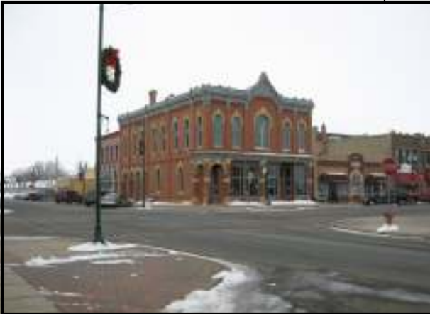
Retail/Office in Historic Downtown Farmington